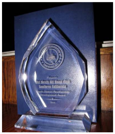
CAL 4 Wheel Drive, new member award